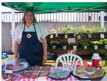
Farmers’ market in US