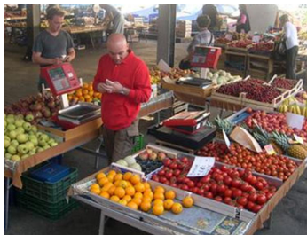
Farmers’ market in Italy

“We can learn from our Italian friends who