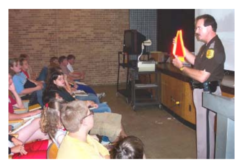
An lowa State Patrol trooper speaks to classes about roadway hazards involving farm equipment.

The program, presented to over 180 driver education students, used an interactive driving simulator to measure reaction times and involved an Iowa State Patrol trooper