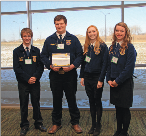
Clay Central/Everly Middle School FFA students received the Outstanding I-CASH Youth Project Award.

The conference theme was a timely reminder of the inherent connections between farming, rural economic viability, and the health and wellbeing of rural residents.