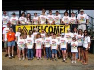
Thousands of children have attended Progressive Farm Safety Days to learn how to avoid accidents. Think about having your kids attend.

It was a cute picture, which illustrated the strong bonds farm kids enjoy with their family. We thought it also showed the value of having kids participate in the hard work and camaraderie that is the core of farm life.