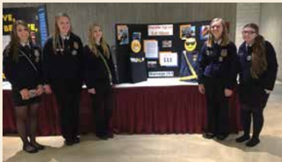
Marengo FFA members with their Buckle Up or Eat Glass display.

The Stay Safe, Take a Break project focuses on farmers and farm families during the busy harvest season. 4-H members select, purchase, assemble and deliver goody bags containing snacks, water, ear plugs, dust masks, and other PPE to area farmers. The visit provides an opportunity for farmers to take a break to stretch, have a snack, and talk to young people about farm safety.