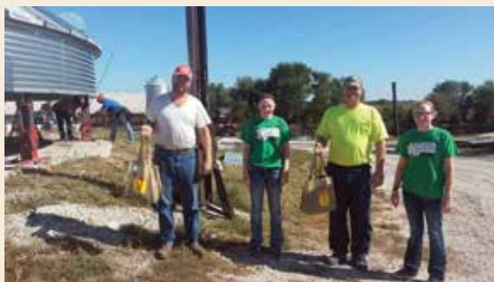
Washington County 4-H members deliver Stay Safe, Take a Break goody bags to area farmers.