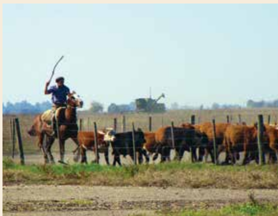
A gaucho moves beef cattle on a family farm, soybeans are harvested in the background.