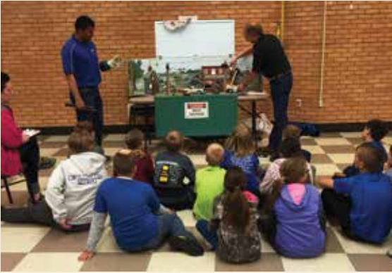
Fourth grade students enjoy presentations at the Cherokee County Farm Bureau's Ag Safety Day.