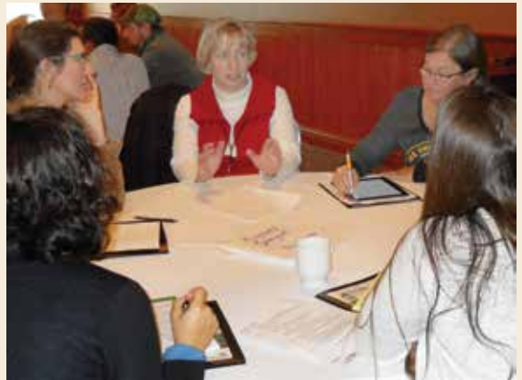
Small group discussions were held on a variety of topics.

group discussions developed follow-up steps to the conference. The conference ended with a 25th anniversary luncheon and presentation from the Lone Tree FFA Chapter, winners of the 2015 I-CASH Outstanding Youth Grant Award.