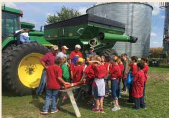
The 4-H County Council and FFA chapters in St. Ansgar and Osage presented farm safety information to over 100 youth.