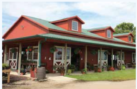
Agritourism safety at Harvestville Farm.

I-CASH sponsored the annual PFI conference held in January, which celebrated 30 years of farmers teaching farmers. The two-day conference featured forty sessions on topics ranging from production to marketing. In addition, I-CASH sponsors the annual Field Day schedule and was featured at the Field Day at Harvestville Farm in Donnellson, IA. The event included a safety walk-through and discussion about safety in agritourism with participants.