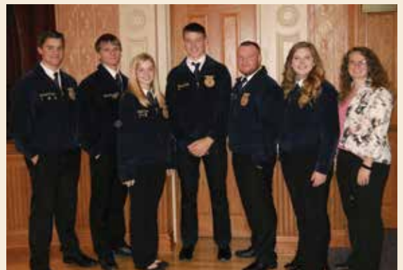
The Lone Tree FFA Chapter received the 2015 I-CASH Outstanding Youth Grant Award.