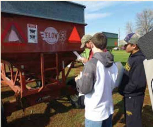
Lone Tree FFA members distributed SMV emblems in their community as part of the I-CASH Seasonal Campaign.

One of the goals from I-CASH's strategic planning process was to increase the visibility of I-CASH around the state. To address this goal, the I-CASH staff and advisory board developed seasonal campaigns to raise awareness about timely issues throughout the year. In operation for over a year now, these promotions regularly partner with ISU Extension and FSA offices to distribute materials. The campaigns include posters, giveaways, and radio public service announcements that air on over 60 radio stations across Iowa. This project provides excellent opportunities for collaboration with our statewide and local partners to increase the reach of our messages.