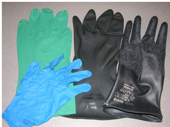
Figure 1. Examples of recommended gloves: nitrile (reusable and disposable), neoprene, and butyl rubber.

The barrier laminate glove ( Figure 2 ) offers the most protection. It consists of two or more different materials that are laminated or blended together. Viton® is another good choice, but is more expensive than most other chemical-resistant gloves. When making decisions about which gloves to purchase, you must consider your risk—the length of time you will be exposed to the pesticide along with the type of pesticide you'll be using ( \text{Risk} = \text{Exposure} \times \text{Toxicity} )—and weigh this against the cost of gloves.