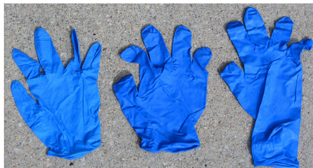
Figure 3. Disposable nitrile gloves in 4-, 8- and 12-mil weights.

In most cases, we recommend wearing gloves under your sleeves to keep pesticide from running down the sleeves and into the gloves (Figure 4). When working with your hands above your head, roll glove tops into cuffs over your sleeves to prevent the pesticide from running down the gloves to your forearms. As an extra safety measure, you can apply duct tape where the glove and sleeve meet. Remember, the most important thing is to wear gloves!