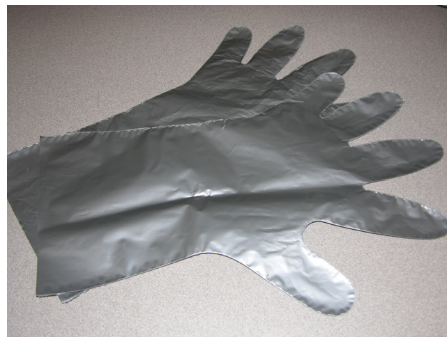
Figure 2. Example of EPA's highest rated protective glove material, barrier laminate.