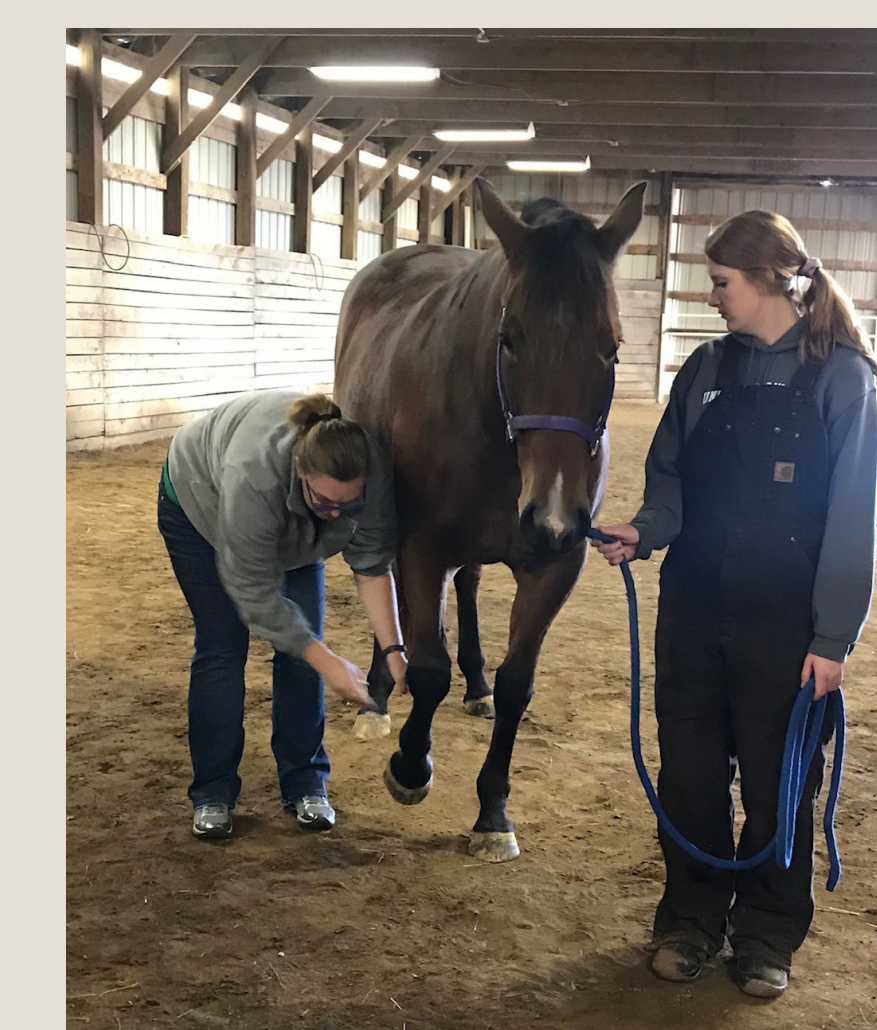
At the annual Pearls of Production two-day, hands-on workshop, Missouri's women producers learn tips for safe animal handling.