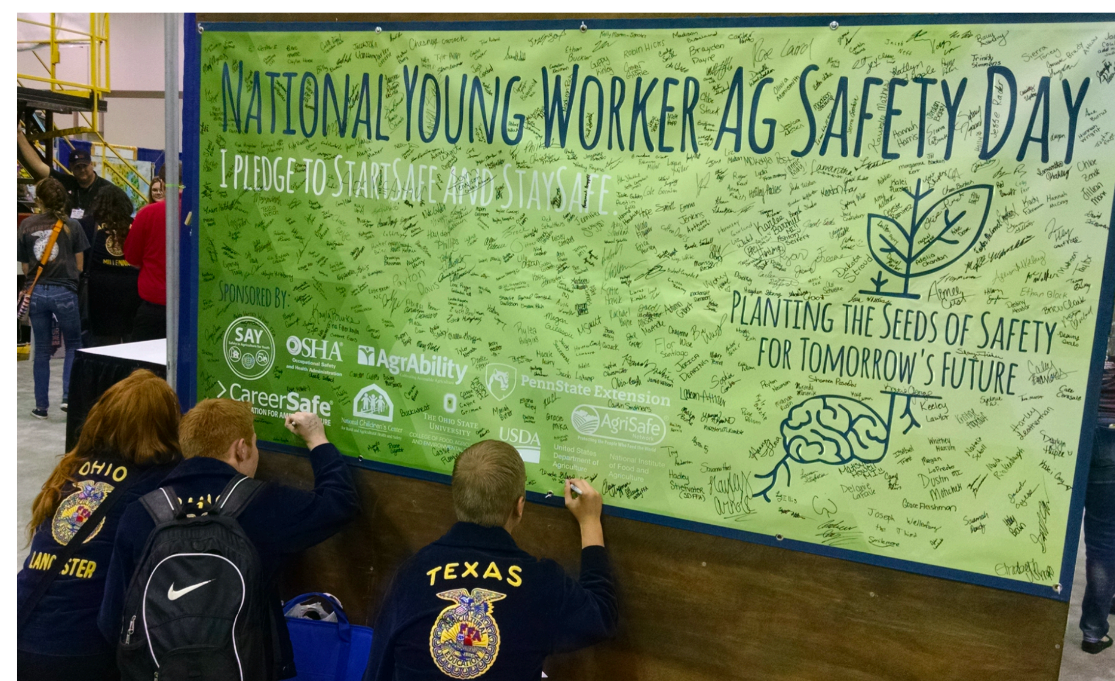
FFA students signing the safety pledge at the National FFA Convention

The SAY Project hosts the National Young Worker Ag Safety Day at the National FFA Convention. This event raises awareness in students by means of a safety pledge and interactive ag safety demonstrations. FFA members complete ag safety stations. The ag safety area is promoted by the SAY Project and National FFA.