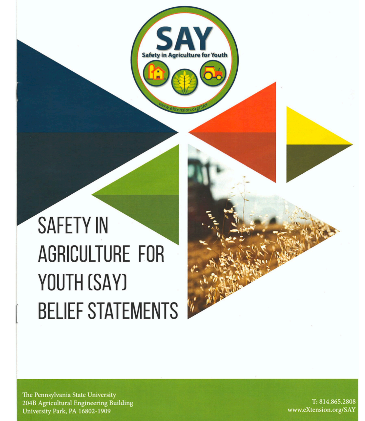
Cover image of the Belief Statement.

The SAY Project National Steering Committee (NSC) was developed in 2014 and meets on a biannual basis to provide input regarding youth farm safety programming to the USDA-NIFA. The NSC developed the belief statement and guiding principles for youth involved in agriculture which has been endorsed by 30 organizations. This committee is charged with exploring opportunities for long-term sustainability of the SAY program and the promotion of SAY products.