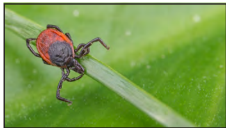
Adult Deer Tick

Can you tell the difference between a deer tick that can carry Lyme disease and a common wood tick?