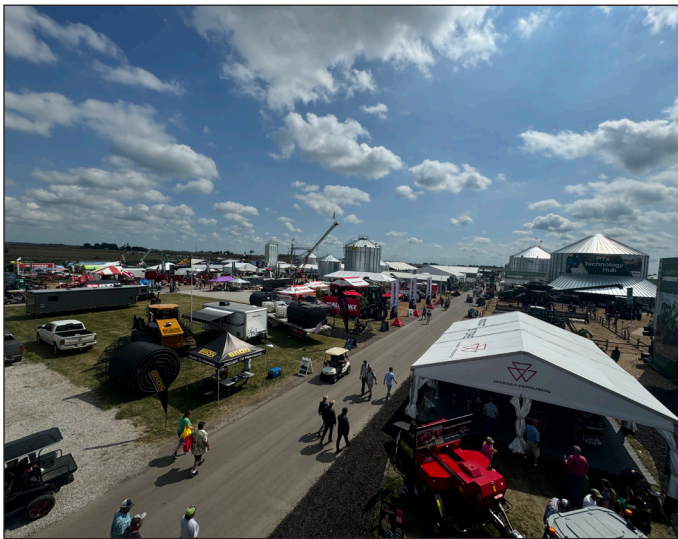
The 2024 Farm Progress Show was held August 27-29 in Boone, IA.

Along with the tape measures, people were also very interested in the chemical storage and the needlestick injury prevention resources, and we heard many stories about personal experiences with combine and tractor fires. The conditions and technology at the show itself sparked many other farm health and safety conversations at our table. One of the other topics that came up (outside of the materials that we brought) was the financial and mental health issues of farming. This was especially top of mind as large, high-dollar equipment was all around at the farm progress show. As always, the weather was also a discussion topic! The weather at the Farm Progress Show was very hot and humid, which opened up many conversations about the heat, adequate hydration, and proper clothing to keep farmers cool and safe in summer months.