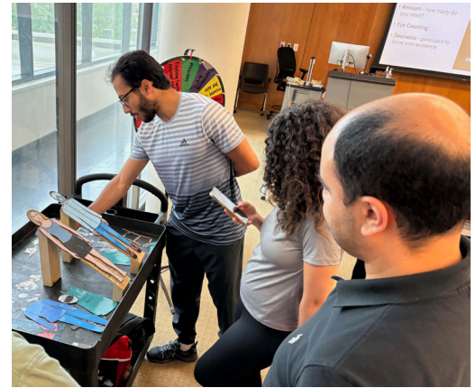
AUB trainees selected appropriate PPE with the “Flat Farmer” activity.

provided lectures on occupational safety and health, safe pesticide handling, vulnerable populations, and prevention of injury and illness in agricultural populations. Following the lectures, the class traveled to Cinnamon Ridge Dairy Farms in Donahue, Iowa to see a robotic dairy operation. As part of the training, the Great Plains Center for Agricultural Health shared outreach methods used to promote safety, including the “Flat Farmer” activity, an equipment lighting and marking display, and gas monitor information. The session also included PPE demonstrations on earplug use and respirator seal checks.