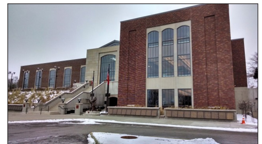
The 2024 MRASH Conference will be held at the Iowa State University Alumni Center, Ames, IA.

The MRASH Conference is a great opportunity for farmers, researchers, educators, students, and ag business and health representatives to learn from one another about the resources, needs and ideas to help make farms healthier places to live and work. Join us and be part of the conversation!