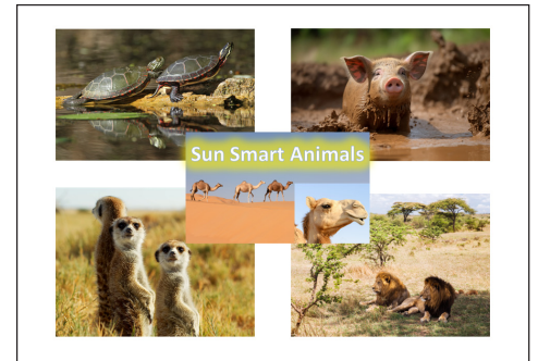
GPCAH outreach staff used the “sun-smart animals” curriculum at NECAS Ag Safety Days.

GPCAH outreach staff presented sun safety lessons to over 250 students (elementary and high school) and adults at the Ag Safety Days hosted by NECAS this summer. We used our “sun-smart animals” curriculum to present the basic concepts of sun safety and guide the discussion. Although the youth were familiar with most of the basic concepts (use sunscreen, wear hat/sunglasses/sun safe clothing, take breaks in the shade to cool down), they were less confident about specific details like identifying the “peak hours” when the sun’s rays are strongest, when protection is most needed, and how often to reapply sunscreen. The youth enjoyed the animal-based curriculum, and even the adults said they learned something!